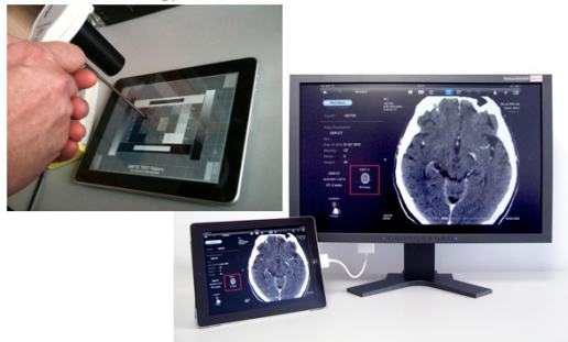
Fig. 3: iPad for Diagnostic Purposes

The display of the iPad is a 9.7" touchscreen with Retina resolution (2.048 x 1.536 pixels at 264 pixels per inch (ppi)) – or the older iPad 2 with 1.024 x 768 pixels resolution. An external (medical) display can be connected to the iPad 2 by an adapter and the iPad can display 1.920 x 1.280 pixels on this external device.